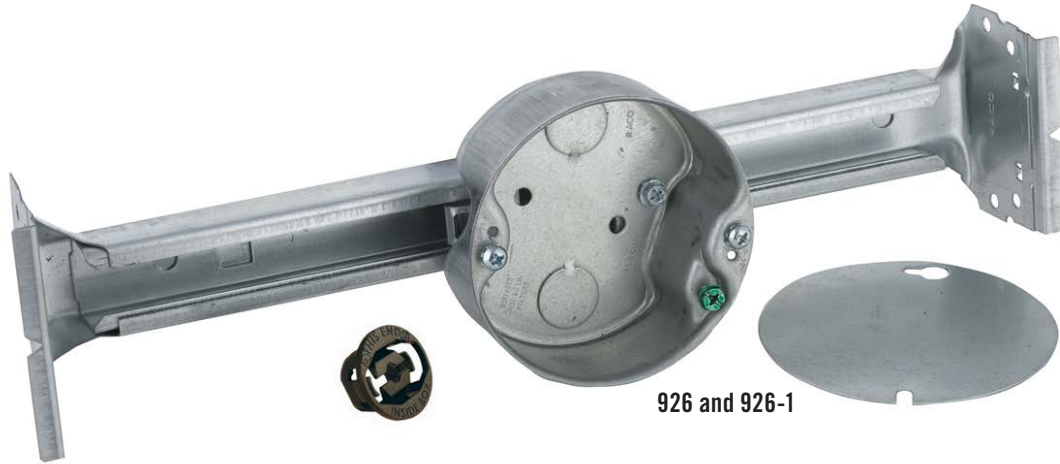
926 and 926-1