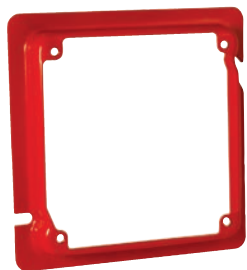
Available in Red for systems identification, Cat. No. 911-16