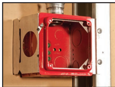
Installs like a mud ring and works with most box positioning brackets