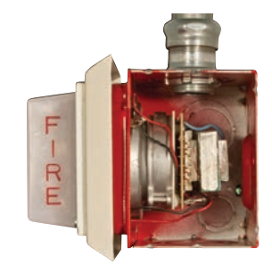
Accepts Largest Life Safety Notifier Applinaces