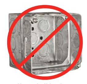
Never build a deep box again