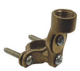
For 1/2" and 3/4" Rigid Conduit RACO 2512, 2522, and 2513

For Bare Armored Ground Wires RACO 2507, and 2508