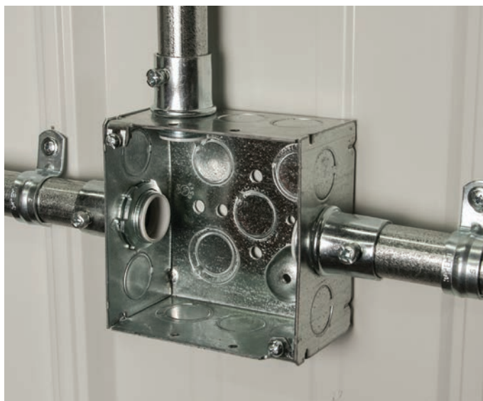
Ideal for channel ridge mounted conduit runs, as well as conduit runs in the wall channel