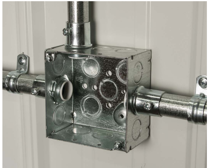
Ideal for channel ridge mounted conduit runs, as well as conduit runs in the wall channel