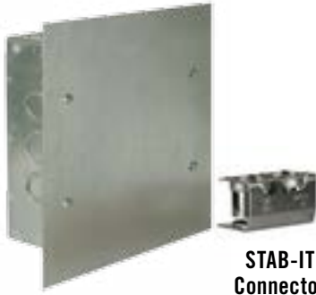
Flush Mount Cover (sold separately)