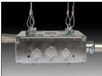
Grand Slam Box installed with 991 Box Hanger