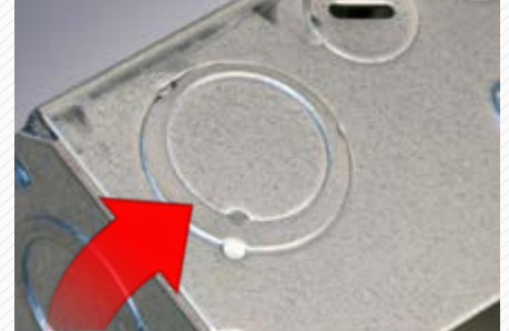
Eccentric knockout on the same side of the box as the STAB-iT connector