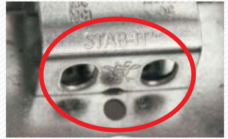
Rollled steel edges eliminate the need for plastic bushings, except for AC Cable