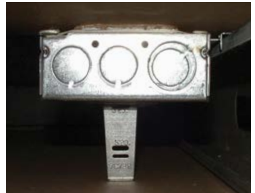
New, Heavy Duty UBS (987), accommodates 2.5" - 6" stud depths, featured on models ending in "HF"