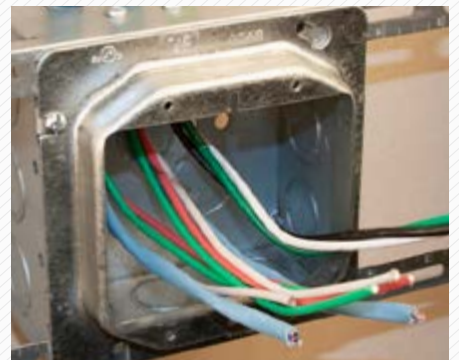
Accepts larger cables, including MC-PCS luminaire cables for smart building applications