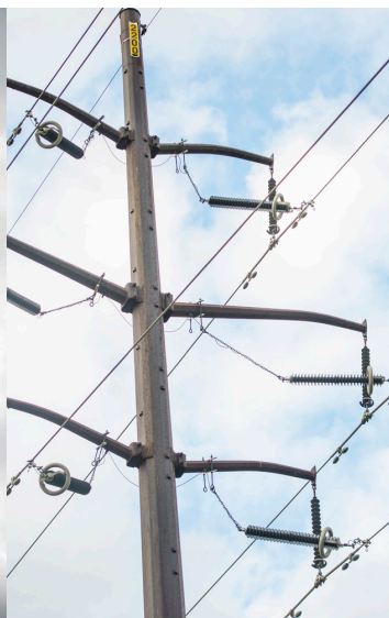
Figure 4: Typical 138 kV line surge arrester application

Since starting the reliability improvement project in 2013, PPL has purchased and installed over 27,000 line surge arresters on 69 kV lines and over 1,500 line surge arresters on 138 kV lines.