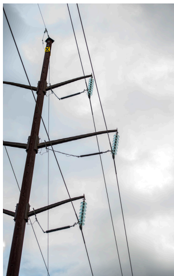
Figure 3: Typical 69 kV line surge arrester application

The 69 kV arresters were installed with the system energized to ensure a minimal impact to customers. PPL incorporated a hotline clamp in the design to complete the installation. However, on the 138 kV systems available clearances and weight of the line surge arresters mandated these arresters were installed with the system de-energized. A typical installation for 69 kV and 138 kV applications are shown in Figure 3 and 4, respectively.