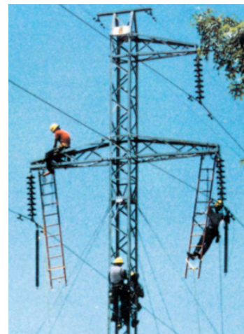
Figure 1: Installation of polymer housed line surge arresters in late 1980's

Numerous case studies and application testimonials have been provided on the successful usage of line surge arresters, at events such as the Insulator News and Market Report (INMR) World Congress. However, the adoption of line surge arresters is an uncertain concept for some utilities, even though the technology has proven itself time and time again. Other interruption mitigation practices can be preferred due to a more extensive product history.