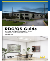
RDC/QS Guide REGIONAL DISTRIBUTION CENTER STOCK AND QUICK SHIP PRODUCT GUIDE www.litecontrol.com