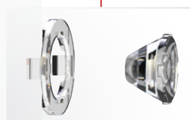
LED offers cool white lamp color providing maximum light coverage with no hot spots