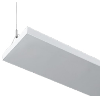
Pendant | SAE103-P-I

Variable Intensity technology provides specifiable lumen output/wattage on the new 100% Indirect 22L and SAE103, pendant and wall.