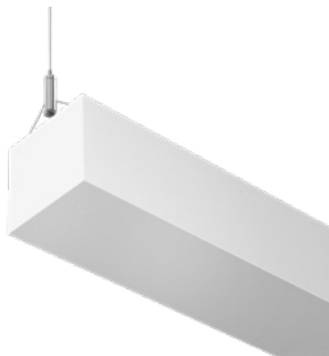
Pendant | 22L-P-I