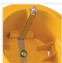
Flush metal ground strap provides easy access to ground screws