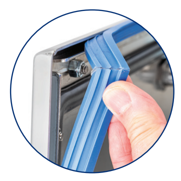
Replaceable silicone gasket

For easier installation, the mounting points remain accessible even when an internal panel is installed. The reversible door features mounting points on both sides, making it easy to remove the door and convert from left to right hinging.