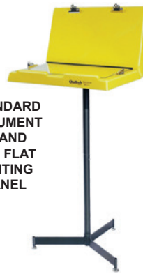
STANDARD DOCUMENT STAND with FLAT WRITING PANEL