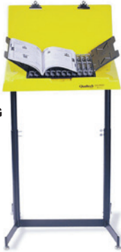
CATALOG DISPLAY STAND