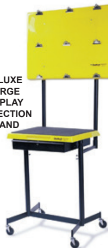
DELUXE LARGE DISPLAY INSPECTION STAND