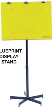
BLUEPRINT DISPLAY STAND