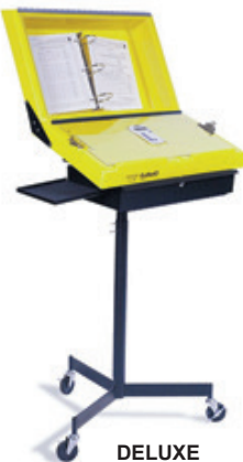
DELUXE INFORMATION STAND