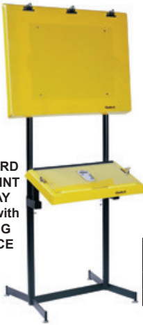
STANDARD BLUEPRINT DISPLAY STAND with WRITING SURFACE