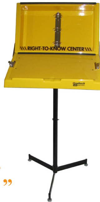
Standard Model Shown: A1200-02

Excerpt from 'Guidelines for Employer Compliance (Advisory)' OSHA MSDS Regulations (Standards - 29 CFR) 1910.1200 App E (4)(B)