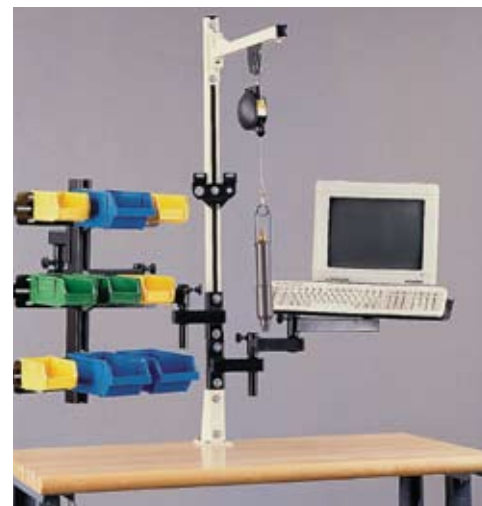
Single Column Kit shown with swing arms. Swing arms may also be used with dual column kits.

Swing arms, with a variety of attachments, can be added to existing workstations or benches. Column mounts clamp on any WS50 or similar column or rail. Bench mount can be bolted to any level surface. Arms, elbows and attachments slide together and can be adjusted to provide maximum worker efficiency...least worker strain. Black baked polyester finish (boards natural, beige or white as shown). Max capacity 30 lbs. (13.5 kg), arm alone or arm and elbow together. Use of three or more arms or elbows on one mount reduces capacity and is not recommended. Swing arms, elbows and attachments include adjustable drag brakes. Installation hardware included with column mounts.