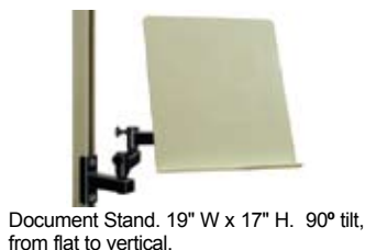
Document Stand. 19" W x 17" H. 90° tilt, from flat to vertical.

Easily fasten to vertical columns of Workstation. Each kit includes one 5" & one 10" arm plus mounting base and attachment shown. Rugged steel construction. All mounting hardware included.