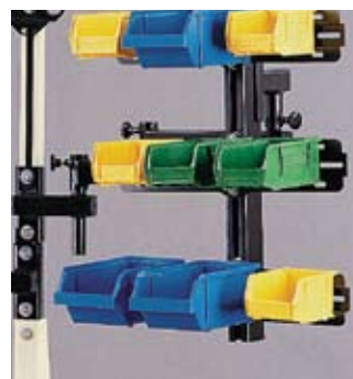
Adjustable, See-thru Rack for Hanging Shelf Bins. 24" H x 18" W. (Accommodates Akro-Mils Akrobins™, as well as Gould Duralux™ bin boxes)