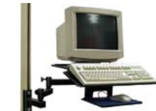
Combo Computer, Keyboard & Mouse Tray. CPU tray 15" x 15"; Keyboard tray 9" x 21", tilts 20°. Mouse tray 9" D x 10.5" W.