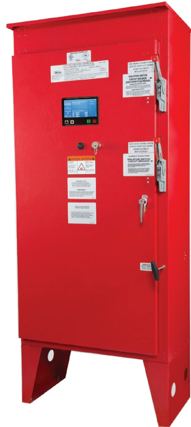
MPT700 Photo Shown

Controllers are completely wired, assembled, and tested at the factory before shipment and ready for immediate installation.