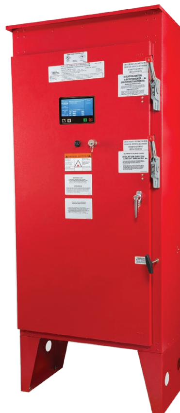
MPT700 Photo Shown

Controllers are completely wired, assembled, and tested at the factory before shipment and ready for immediate installation.