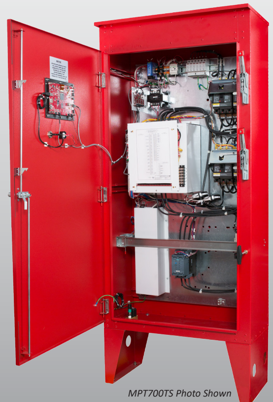
MPT700TS Photo Shown

Controllers are completely wired, assembled, and tested at the factory before shipment and ready for immediate installation.