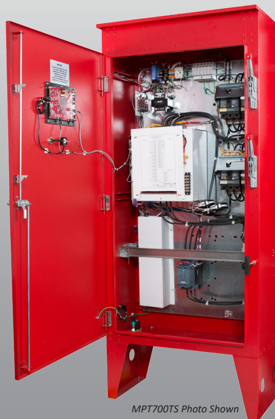
MPT700TS Photo Shown