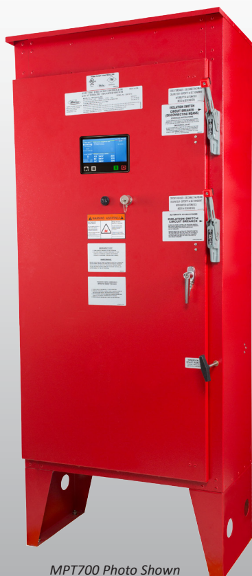
MPT700 Photo Shown

Available in Across-The-Line, Soft Start, Wye-Delta Open & Closed Transition Starting Methods For Select Models, HP and Voltage Ranges Only