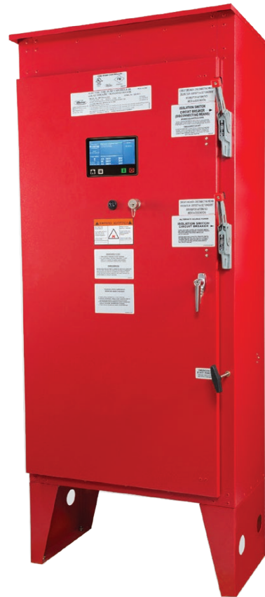
MPT700 Photo Shown

Controllers are completely wired, assembled, and tested at the factory before shipment and ready for immediate installation.