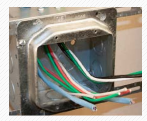
Accepts larger cables, including MC-PCS luminaire cables for smart building applications