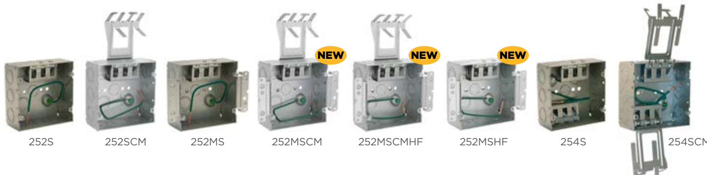
Boxes - 4-11/16" Square, 2-1/8" deep. Construction - Welded steel with raised grounds.