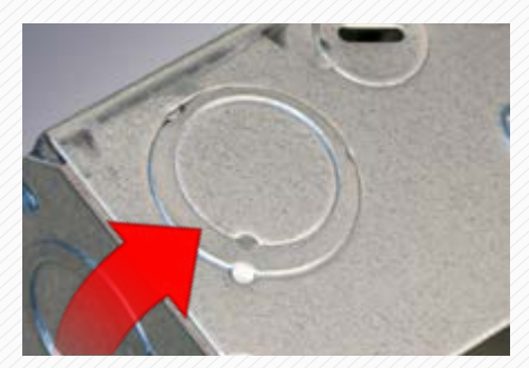
Eccentric knockout on the same side of the box as the STAB-iT connector