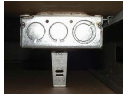
All models containing an "M" or "H" after the 3 digit number feature RACO's Universal Box Support. This excludes part numbers ending with "HF"