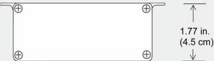
Figure 3. Fiber service unit front view