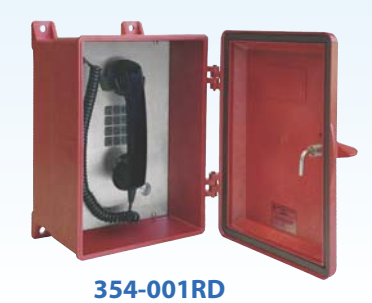
Enclosures 255-003 Series (NEMA 4X)