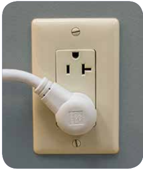
45° Angle Plug (15A only)

Green LED indicates surge protection working