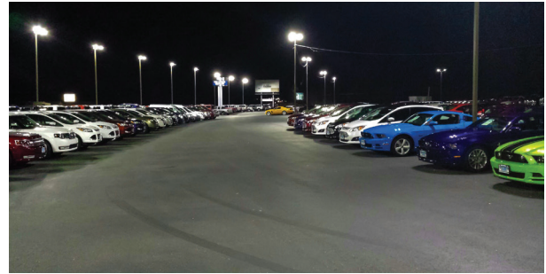
Frontier Ford, Anacortes Washington

The dealership owners are extremely pleased with the final result and noticed immediate improvements in energy use and cost savings. Frontier Ford reported energy savings of approximately 197,000 kwh per year or $22,000 per year in energy costs.