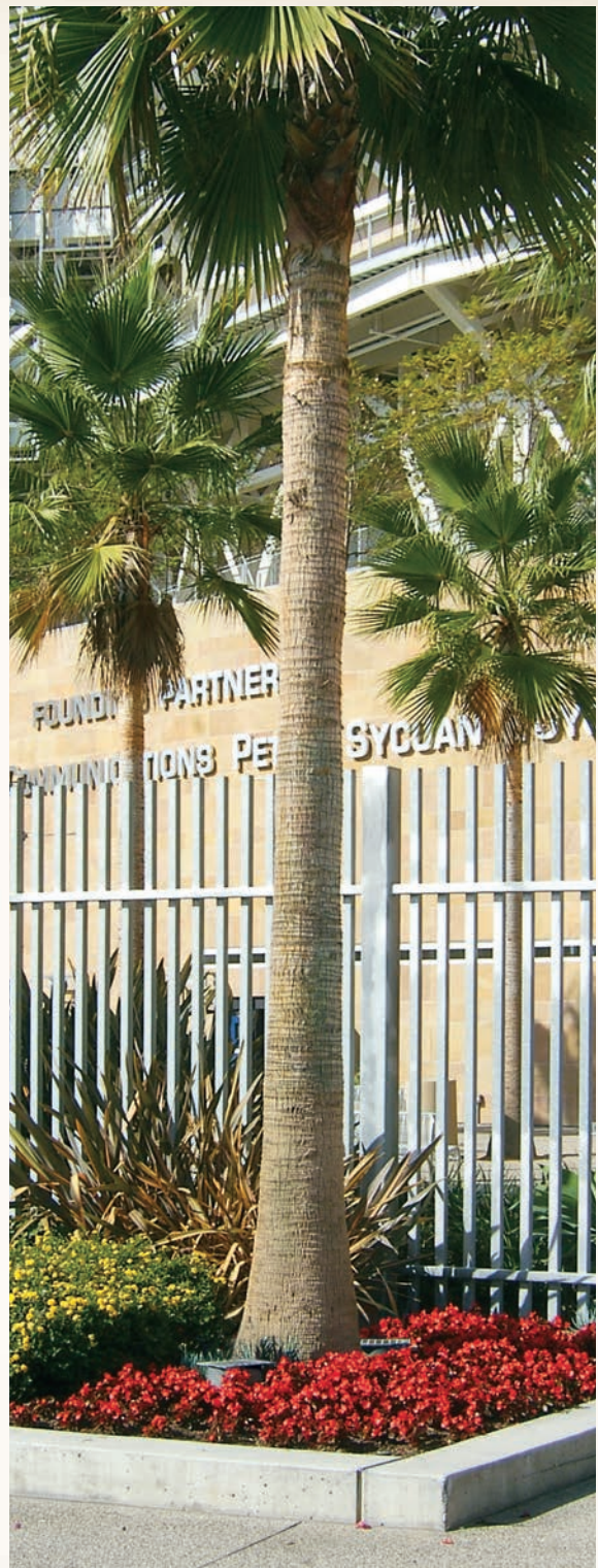
Petco Park, home of the San Diego Padres.

The below grade well with a gravel base and a remote junction box insures the C54's water resistance.