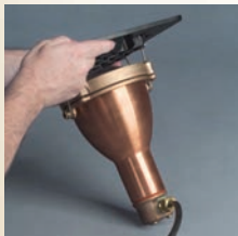
C54 lamp module with 6 ft. water resistant cord.

Refer to kimlighting.com for a more detailed specification sheet and ordering information