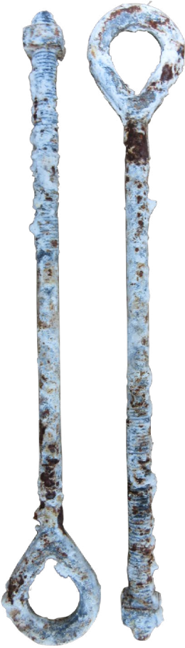
HDG at 3000 hours