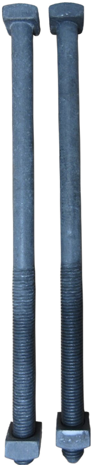
ArmorGalv at 3000 hours