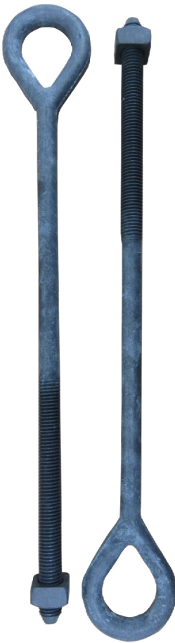
ArmorGalv at 3000 hours