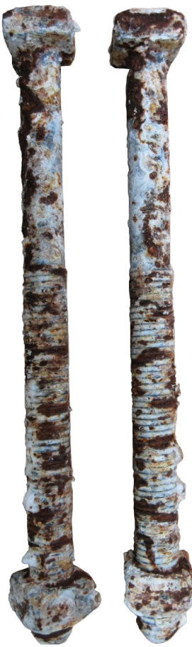
HDG at 3000 hours