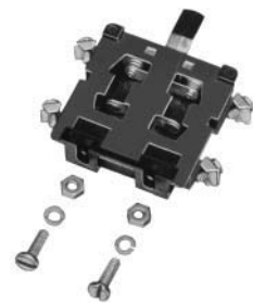
Class 9999 Type KX3 Contact Kit