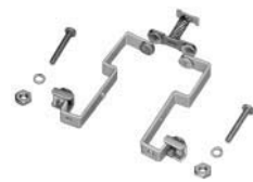
Class 9999 Type KX5 Contact Kit

Applications requiring double pole normally open Type M contactors can be met by supplying single pole normally open contactors with tie bars. The tie bar is made from an insulating material and connects the armatures of the contactors together. For double pole contactors, it is recommended that the operating coils be connected in series. Each coil should be rated for one half of line voltage.