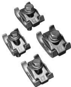
Class 9999 Type ML1 Lug Kit