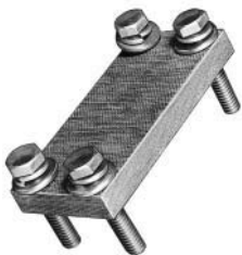
Class 9999 Type MT2 Tie Bar Kit