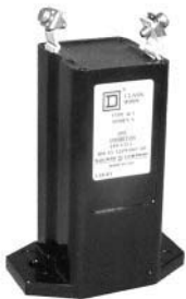
Class 9999 AI1 Arc Suppressor

The AI1 arc suppressor will limit the inductive voltage surge to a maximum of 600 VDC when applied in accordance with the application chart. When applying the arc suppressor to a circuit, two factors must be considered – the current drawn by the inductive load and the number of times per minute that the load will be interrupted. Once these two factors are determined, the application is checked against the application chart. The chart shows the maximum interruptions per minute that the arc suppressor can handle at a given current. As long as an application falls below the curve, the arc suppressor will handle the load. The arc suppressor is connected in parallel with the inductive load and is in the circuit at all times.