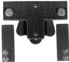
Class 9999 Type MM2 Mechanical Interlock Kit

A horizontal mechanical interlock is available for use between two single pole, normally open or two double pole, normally open tied contactors mounted side by side. This interlock prevents the two contactors from opening simultaneously.