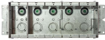
① ② ③