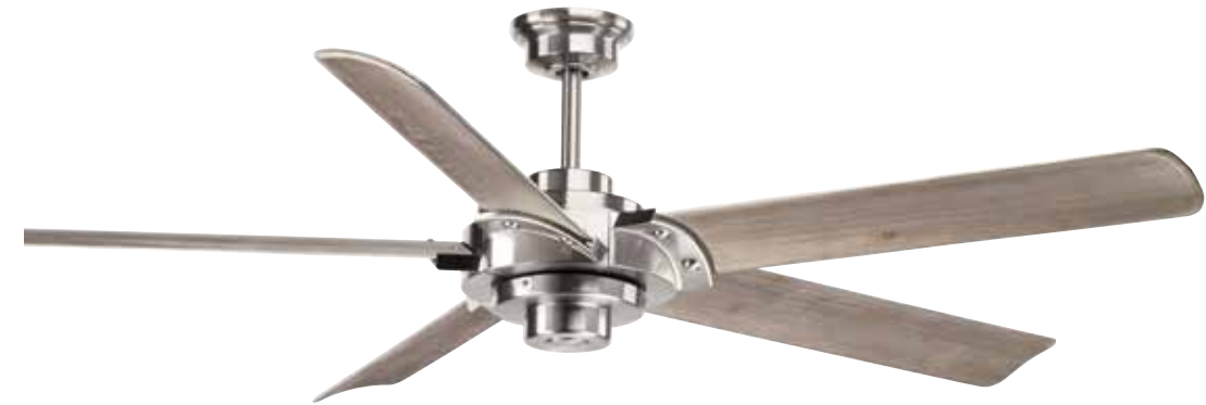
P2546-09 shown with Driftwood blades