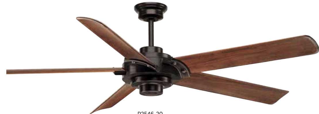
P2546-20 shown with Walnut blades