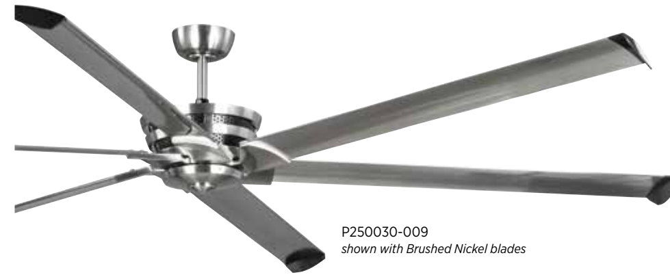
P250030-009 shown with Brushed Nickel blades