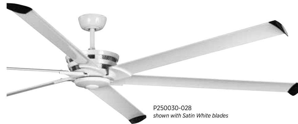
P250030-028 shown with Satin White blades