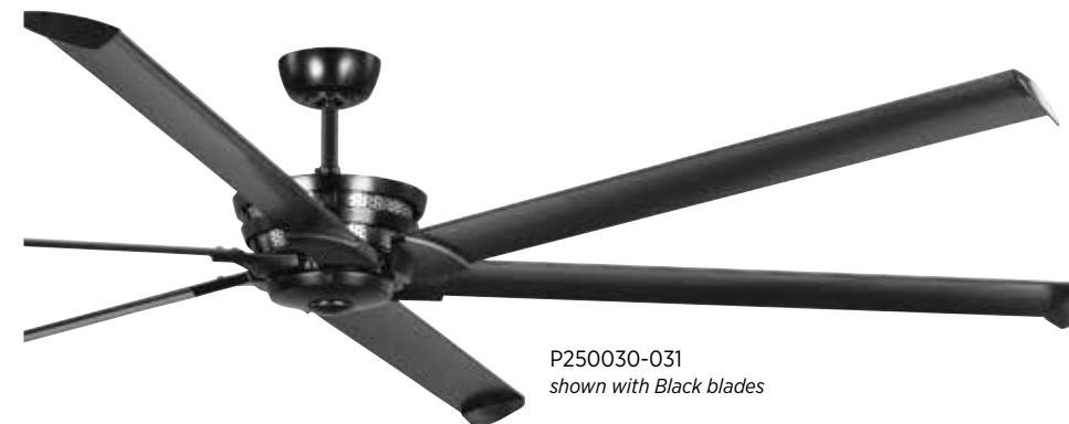
P250030-031 shown with Black blades