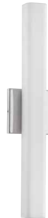
P300182-015-30 mounted vertical