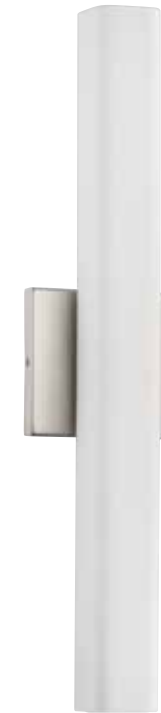
P300182-009-30 mounted vertical