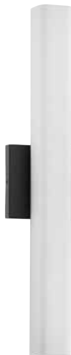
P300182-129-30 mounted vertical