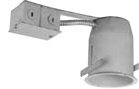
Remodel Non-IC with LED Quick Connect