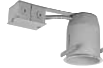
Remodel Non-IC with E26 socket