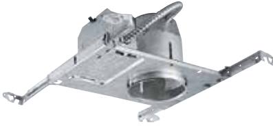
New Construction Non-IC with LED Quick Connect

For complete fixture, order housing with trim.