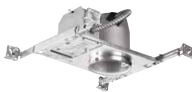
New Construction Air-Tight IC with LED Quick Connect