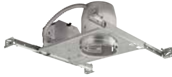
New Construction Non-IC with E26 socket