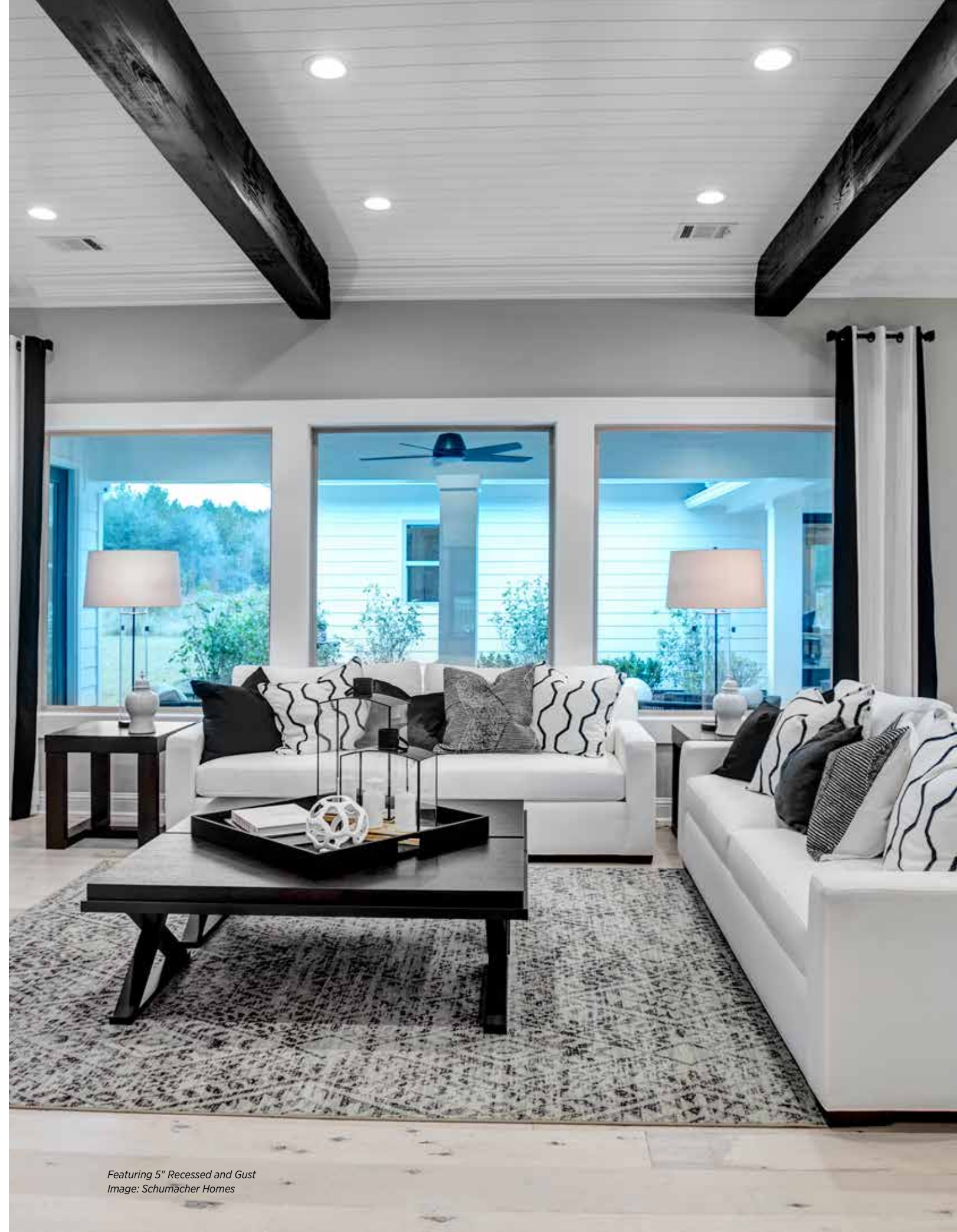
Featuring 5" Recessed and Gust