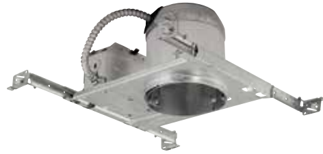
New Construction Air-Tight IC and Non-IC with E26 socket

For complete fixture, order housing with trim.