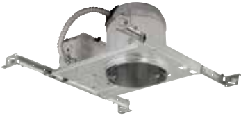
New Construction Air-Tight IC with LED Quick Connect

For complete fixture, order housing with trim.