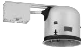
Remodel Air-Tight IC with LED Quick Connect