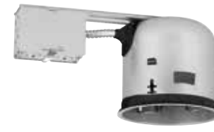
Remodel Air-Tight IC with E26 Socket

For complete fixture, order housing with trim.