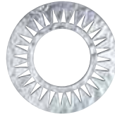
P8584-01 P8588-01 P8587-01 P8589-01

Ceiling gasket seals housing to drywall opening for Washington State Energy Code compliance.