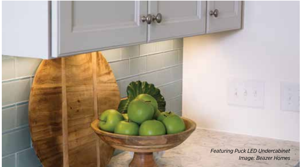
Featuring Puck LED Undercabinet