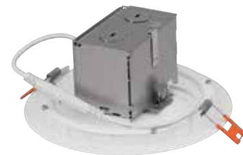
P800005-028-30 back view shown with junction box attached