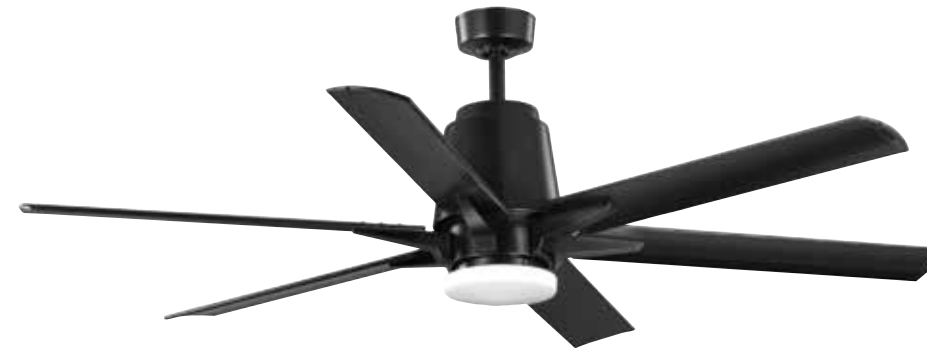
P250026-031-30 shown with Black blades