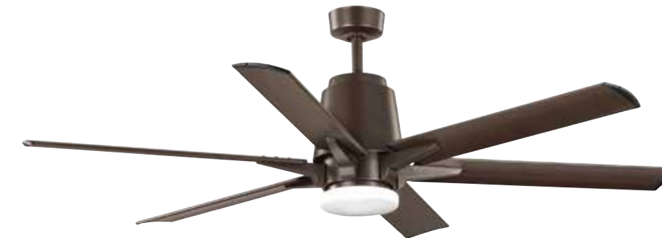
P250026-129-30 shown with Architectural Bronze blades