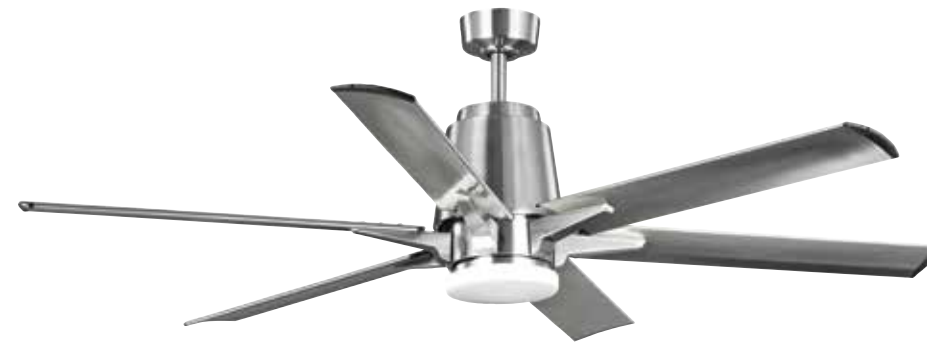
P250026-009-30 shown with Brushed Nickel blades