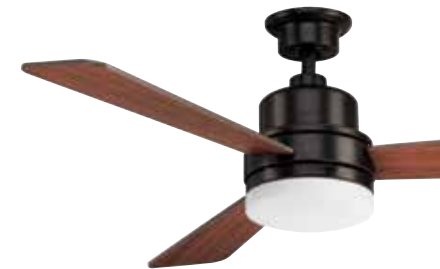
P2556-2030K shown with Medium Cherry blades