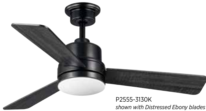
P2555-3130K shown with Distressed Ebony blades