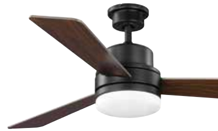
P2553-129WB shown with Medium Cherry blades