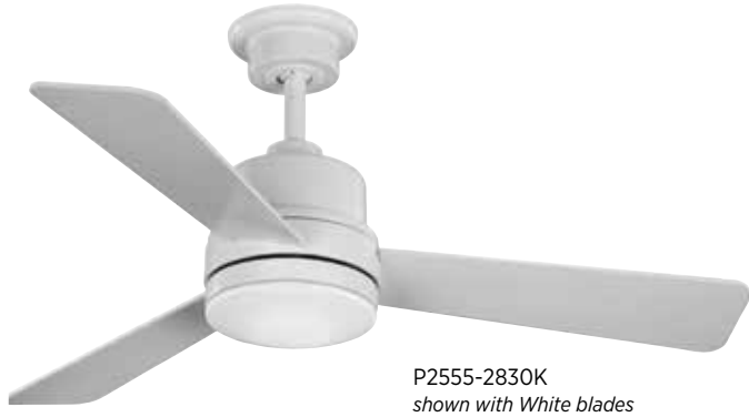
P2555-2830K shown with White blades