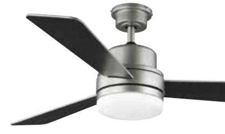
P2553-152WB shown with Black blades