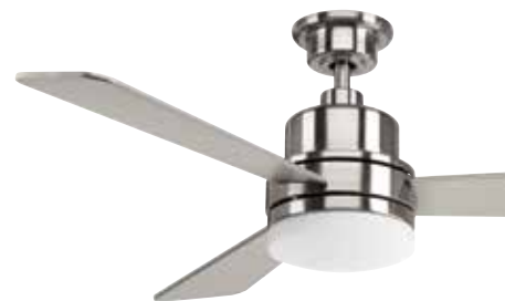
P2556-0930K shown with Silver blades