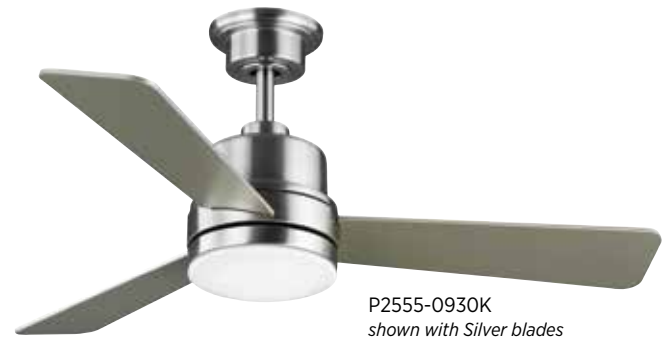
P2555-0930K shown with Silver blades