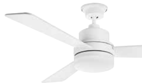
P2556-3030K shown with White blades