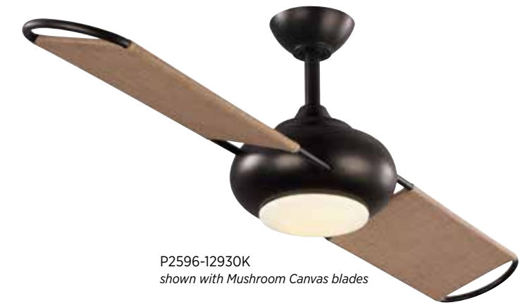
P2596-12930K shown with Mushroom Canvas blades