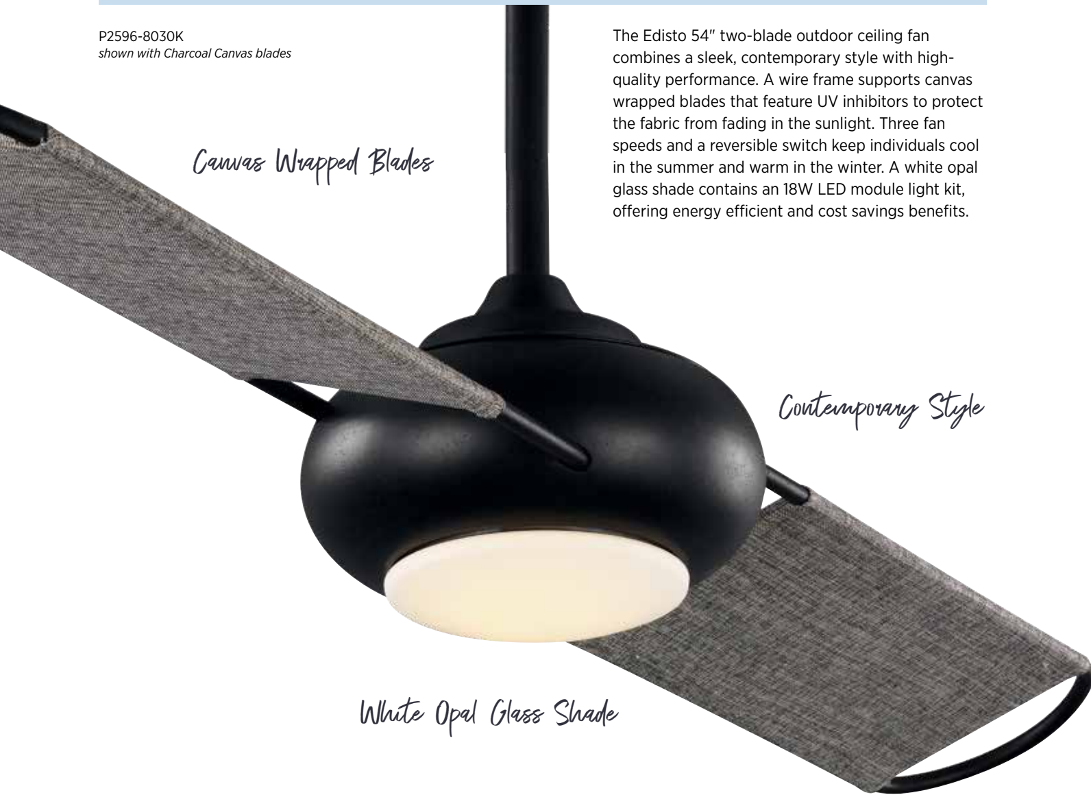
P2596-8030K shown with Charcoal Canvas blades