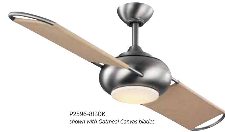
P2596-8130K shown with Oatmeal Canvas blades