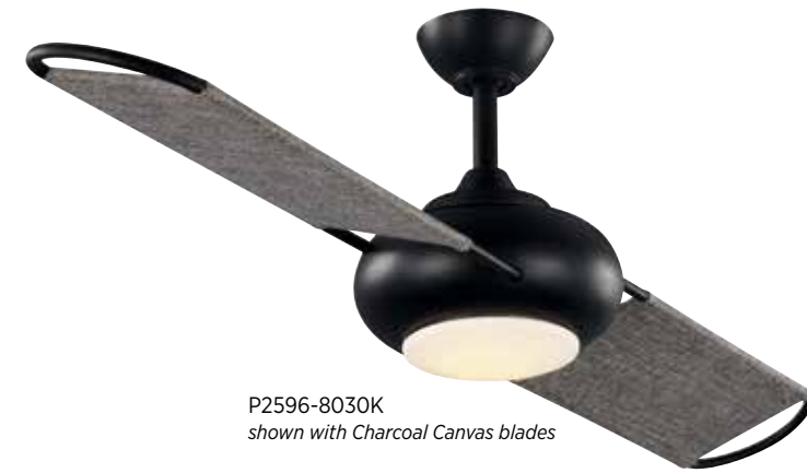
P2596-8030K shown with Charcoal Canvas blades