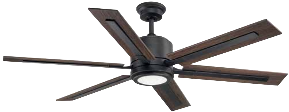
P2586-7130K shown with Toasted Oak blades