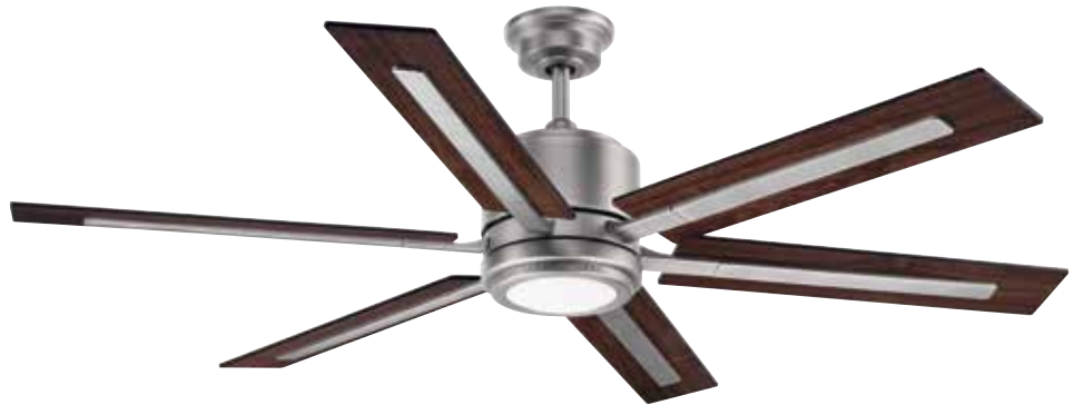
P2586-8130K shown with Classic Walnut blades