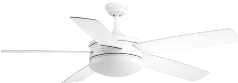
P2548-3030K shown with White blades

Five-blade 60" Fresno ceiling fan features an LED light source, offering both form and function with energy and cost-savings benefits. A white opal glass shade features an 18W dimmable, 3000K LED module. A remote control with full range dimming and remote control is included.