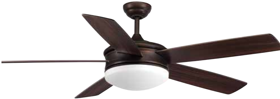
P2548-2030K shown with Dark Walnut blades