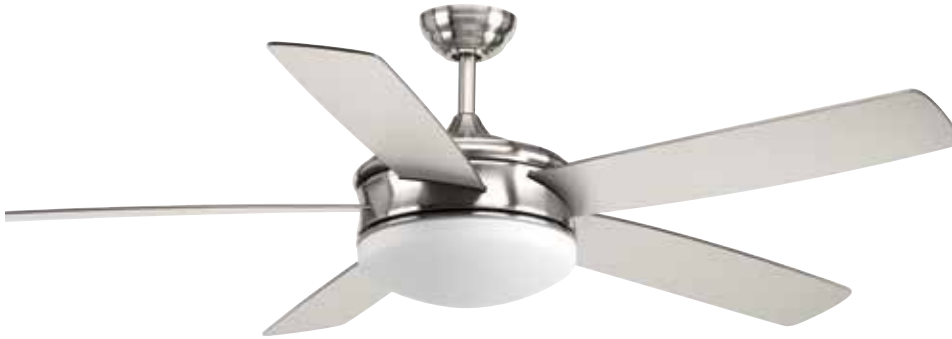
P2548-0930K shown with Silver blades