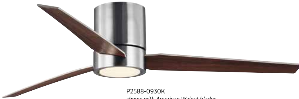
P2588-0930K shown with American Walnut blades