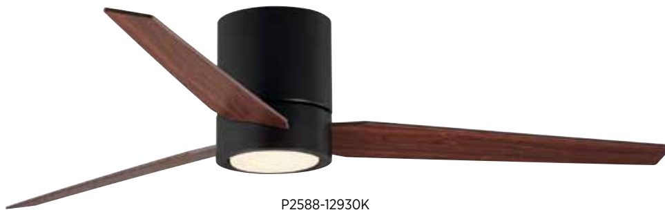
P2588-12930K shown with Medium Cherry blades

This Braden 56", three-blade, hugger-style ceiling fan features clean lines and a design that complements modern interiors. A shatterproof white opal glass shade contains an integrated 18W LED module, offering both form and function with energy and cost-savings benefits. Featuring a larger motor, Braden moves more air than a traditional hugger ceiling fan.