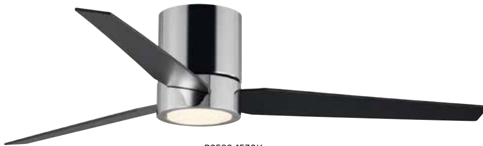
P2588-1530K shown with Black blades