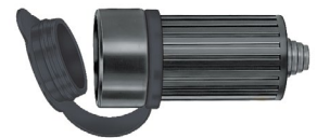
HBL60CM19 Shown with HBL6018