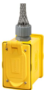
Deluxe Cord Grips (purchased separately)