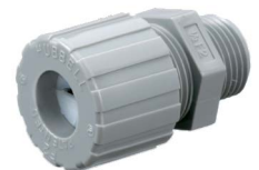
Gray Nylon Cord Connector