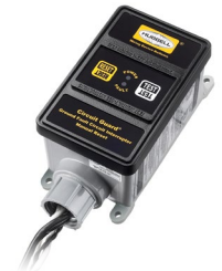
Manual Reset GFCI