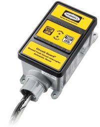
Automatic Reset GFCI