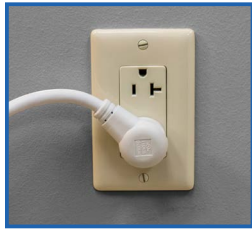
45° Angle Plug (6 outlet 15A models only)