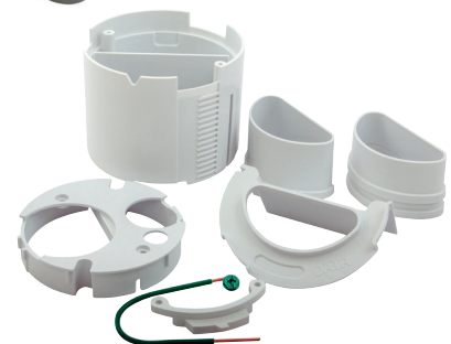
Furniture Feed Activation