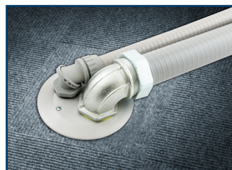
Finish with cover S1R4FFCVR