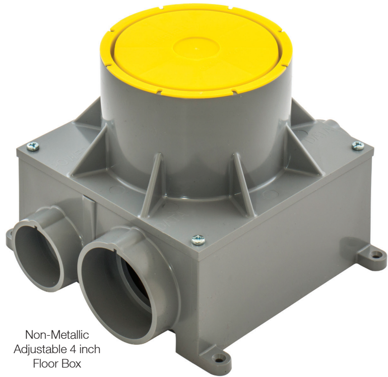
Non-Metallic Adjustable 4 inch Floor Box